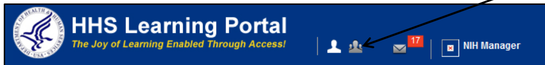
Figure 1 – My Team icon